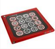
T32187 FlashPad 3.0 LED Touchscreen Handheld Game w/ Score Reader