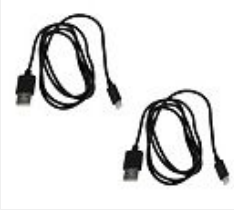
E225218 HALO Set of 2 Lightning USB Cables for iPhone