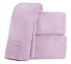
H192468 Malden Mills Polarfleece(R) Ella Queen Sheet Set